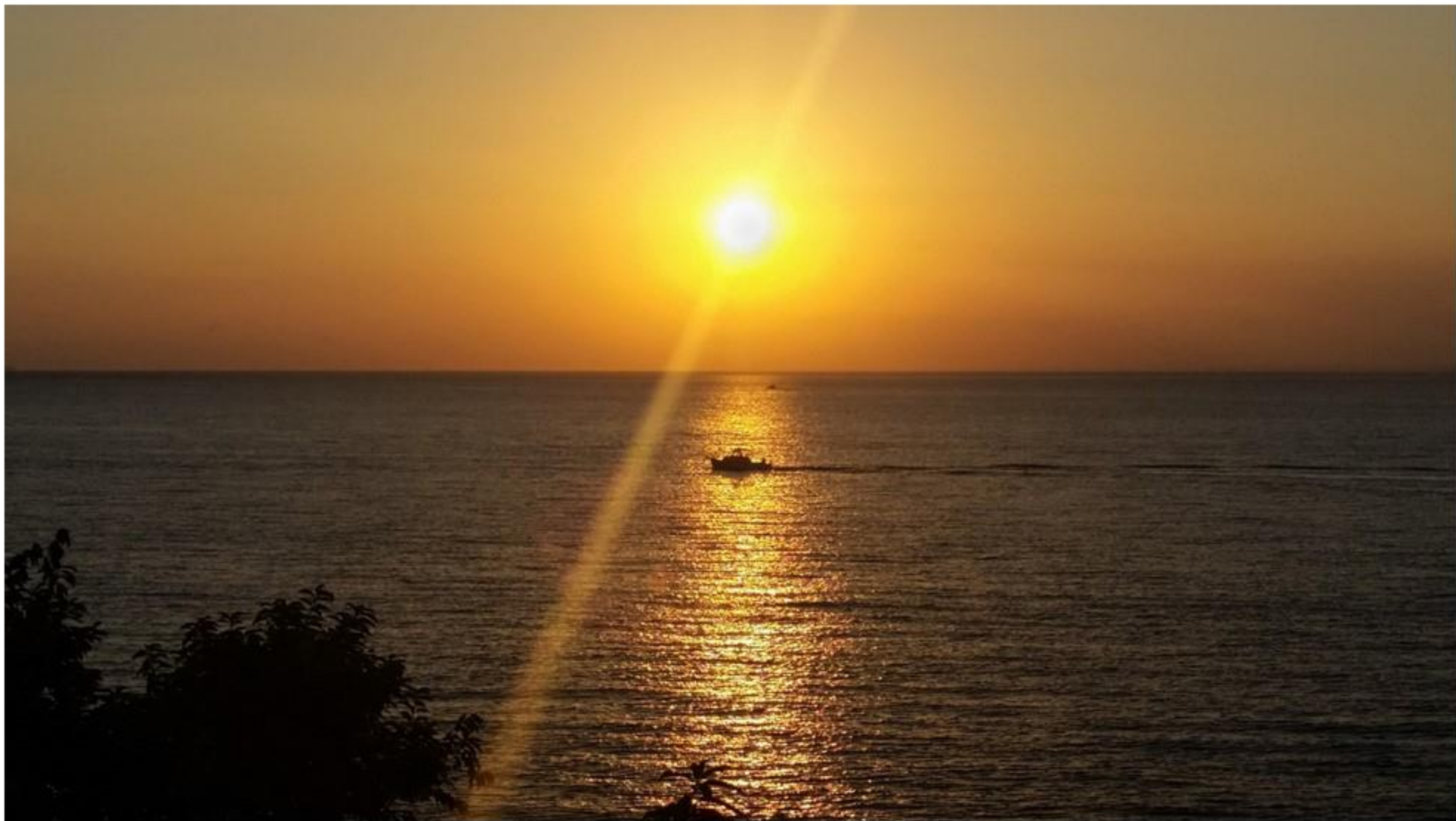
DIANA SKOWRONSKA, 13