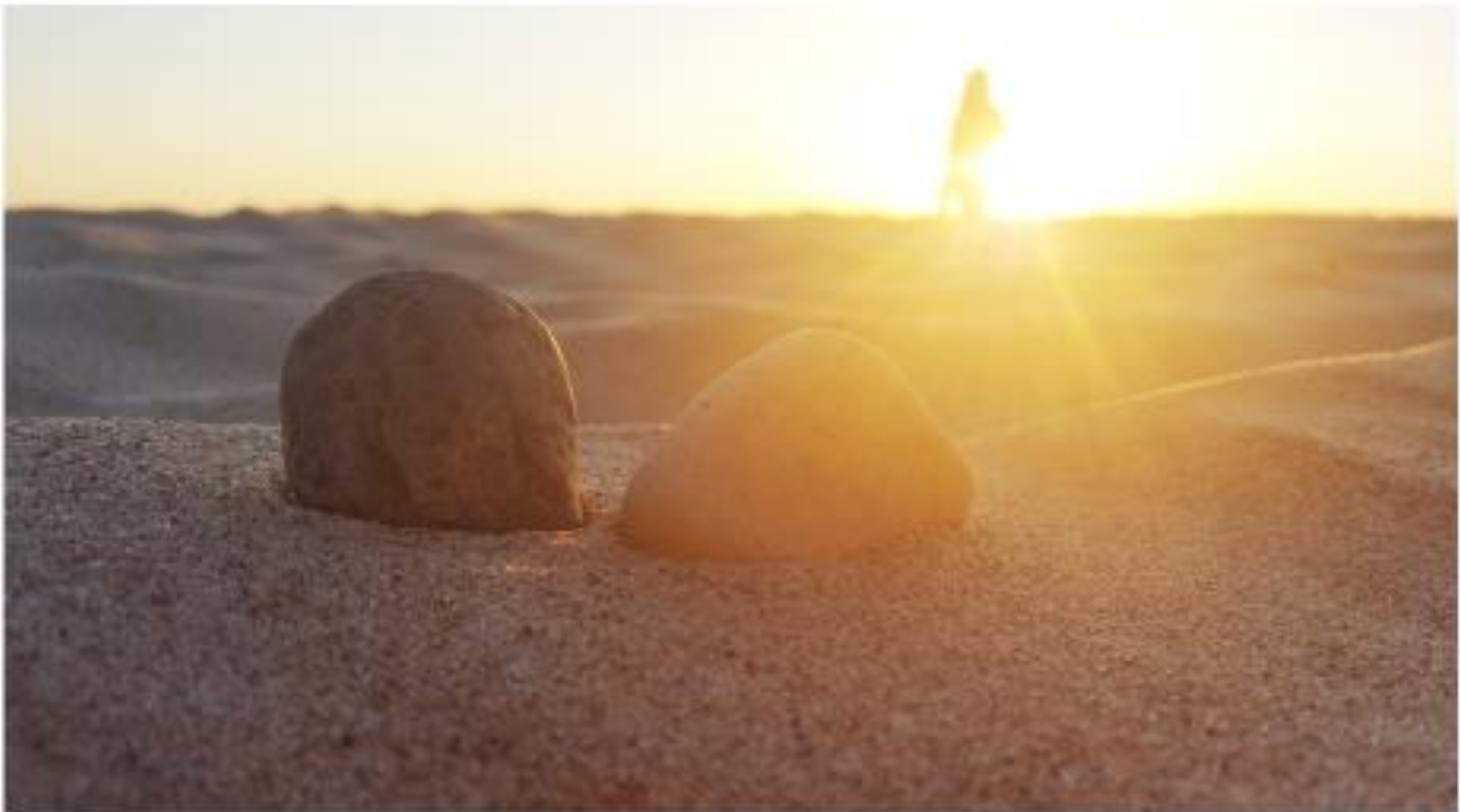
KAMILE FOKAITE, 17 FRAGILE SEA SONG IN MY IMAGINATION LITHUANIA

The salty wind slightly ruffles my hair. I'm here again, near the sea. I close my eyes and try to imagine how it was before. I imagine blue waves washing the shore. My feet sank into the warm, clean sand. I think I can smell the clear air mixed with a scent of pines and even hear a beautiful sea waves' song and seagulls voices. I dip my feet in the water and feel clear water wrapping all me. I immerse my whole body in the sea. Through clear water I can see sea soles and little fishy passing me. And as soon as I open my eyes I face the reality. Immediately, the smell of rotting mud reaches my nose. I can see green waves and a plastic bag, fag-end and fishing net passing in them. And now, not too long ago, the factory polluted the waters by plunging its ugly hose into the Curonian Spit and releasing its pollutants which sail to the sea. How people can be so cruel ?