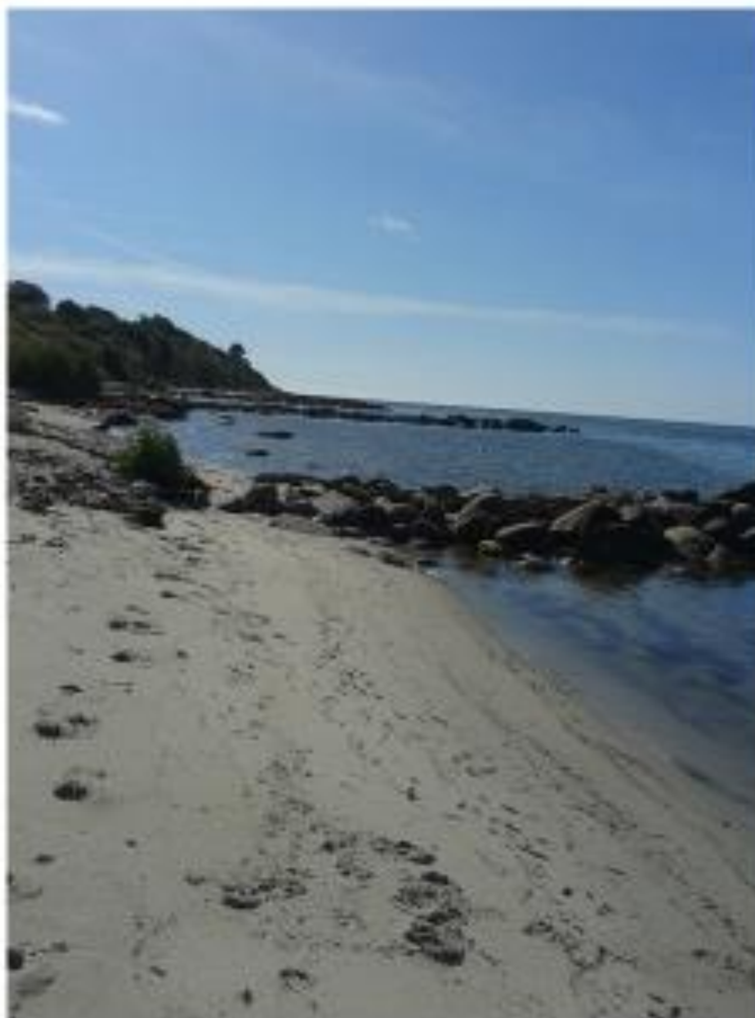
ALEKSANDRA TREPCZYK, 14 MYSTERIOUS SEA CREATURE POLAND

One summer day I went to the beach with my sister to take some photos. We found a beautiful place where we wanted to take a photo when I suddenly found footprints in the sand. The footprints were very small, but they didn't look like animal prints. They were definitely human. Extremely curious, we followed the trail.