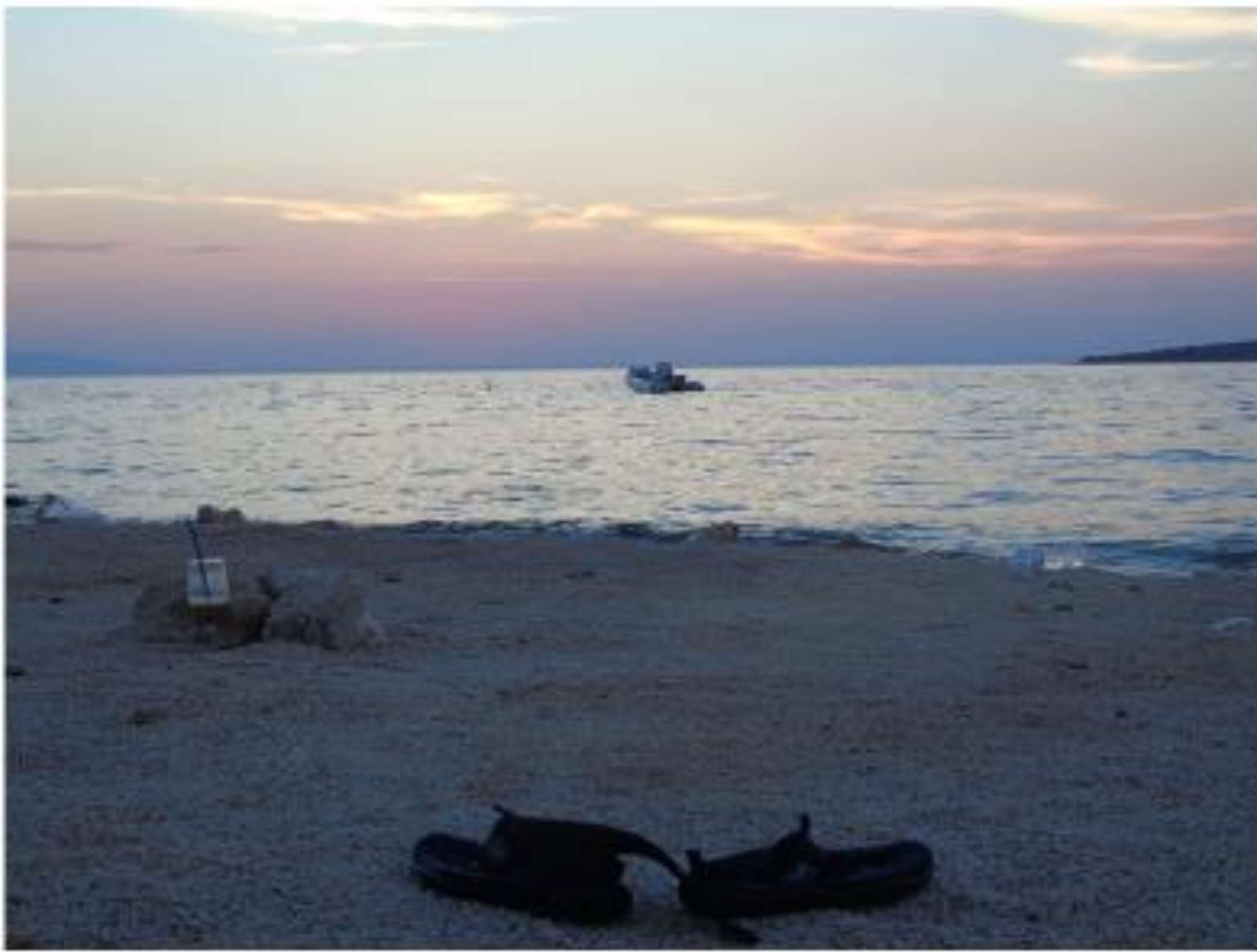
MIKOŁAJ MIŁOSTAN, 19, POLAND THE POWER AND BEAUTY OF THE WORLD, TOUCHED BY THE NEGATIVE ACTION OF MAN

The prepared work presents a piece of beach and on the other plan of the picture, the sea during the sunset. This painting shows the beauty and power of nature, which is disturbed by the negative influence of a man. In the picture we see human boots thrown out by the sea and left on the beach, which previously polluted the sea, and now they are littering the beach. The photo also presents a left-over, unfinished drink that pollutes the beach environment and destroys its beauty. On the waters of the sea is lifted a motor dinghy that is used by a man, which pollutes the sea water in this way. So we see that the beauty of the natural environment of the man - the beach and the sea, are disturbed by the destructive human action.