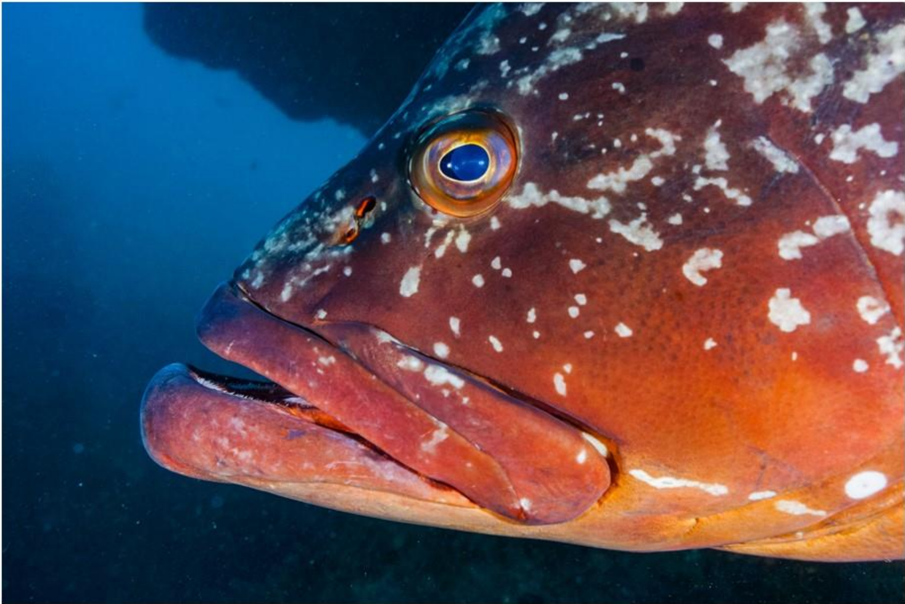
SZYMON VASCONCELOS, 10