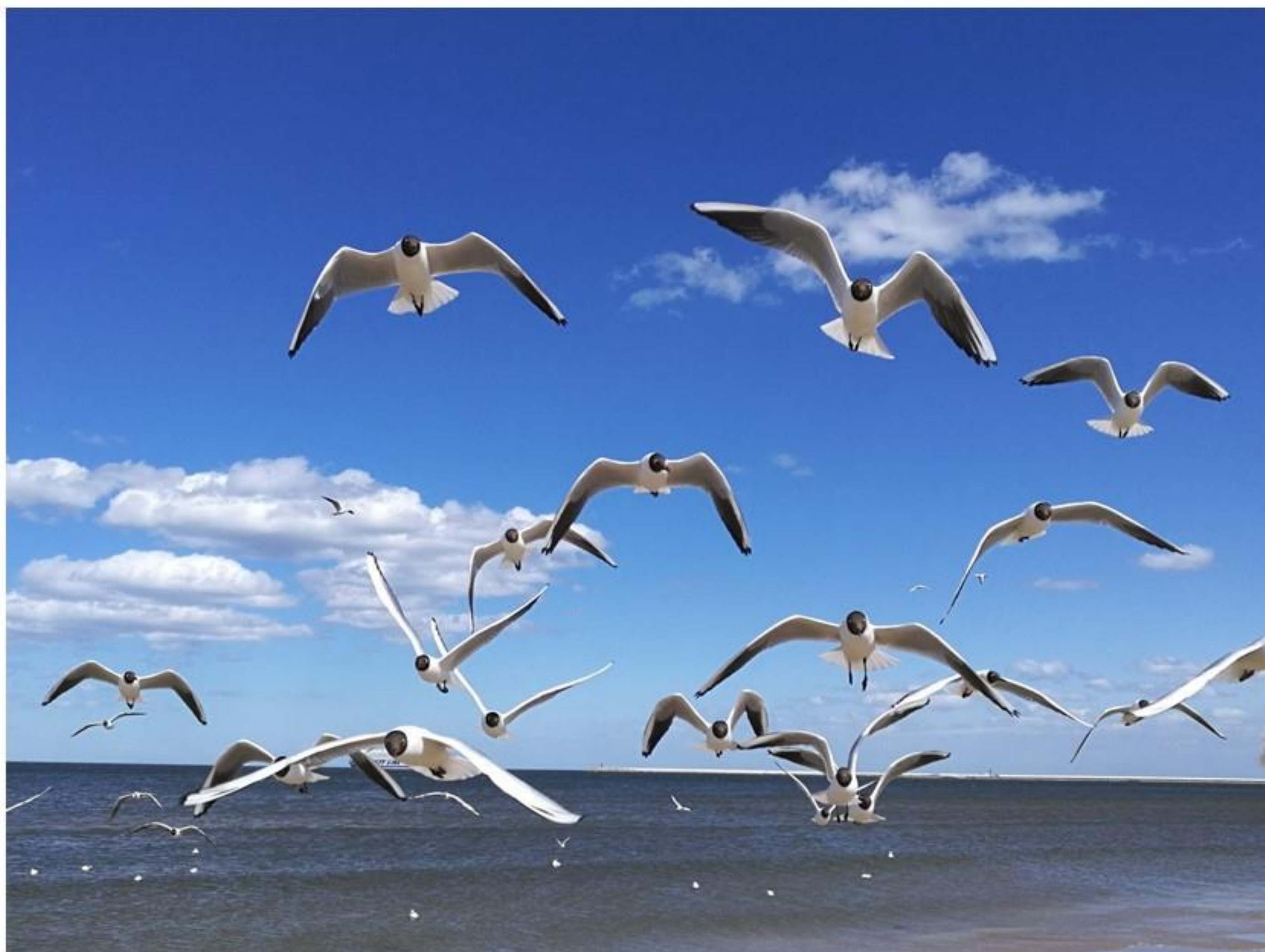
WERONIKA ADAMIAK, 14