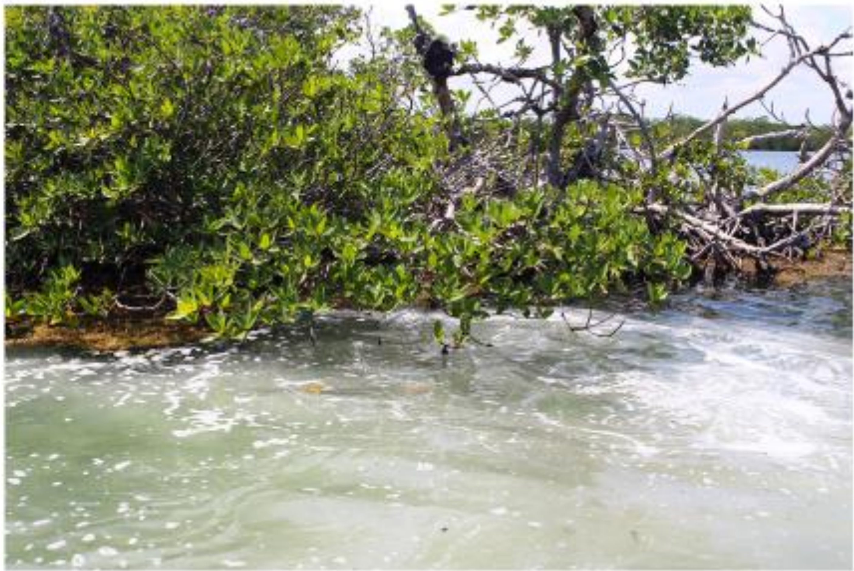
EMILY CIOCZEK 13