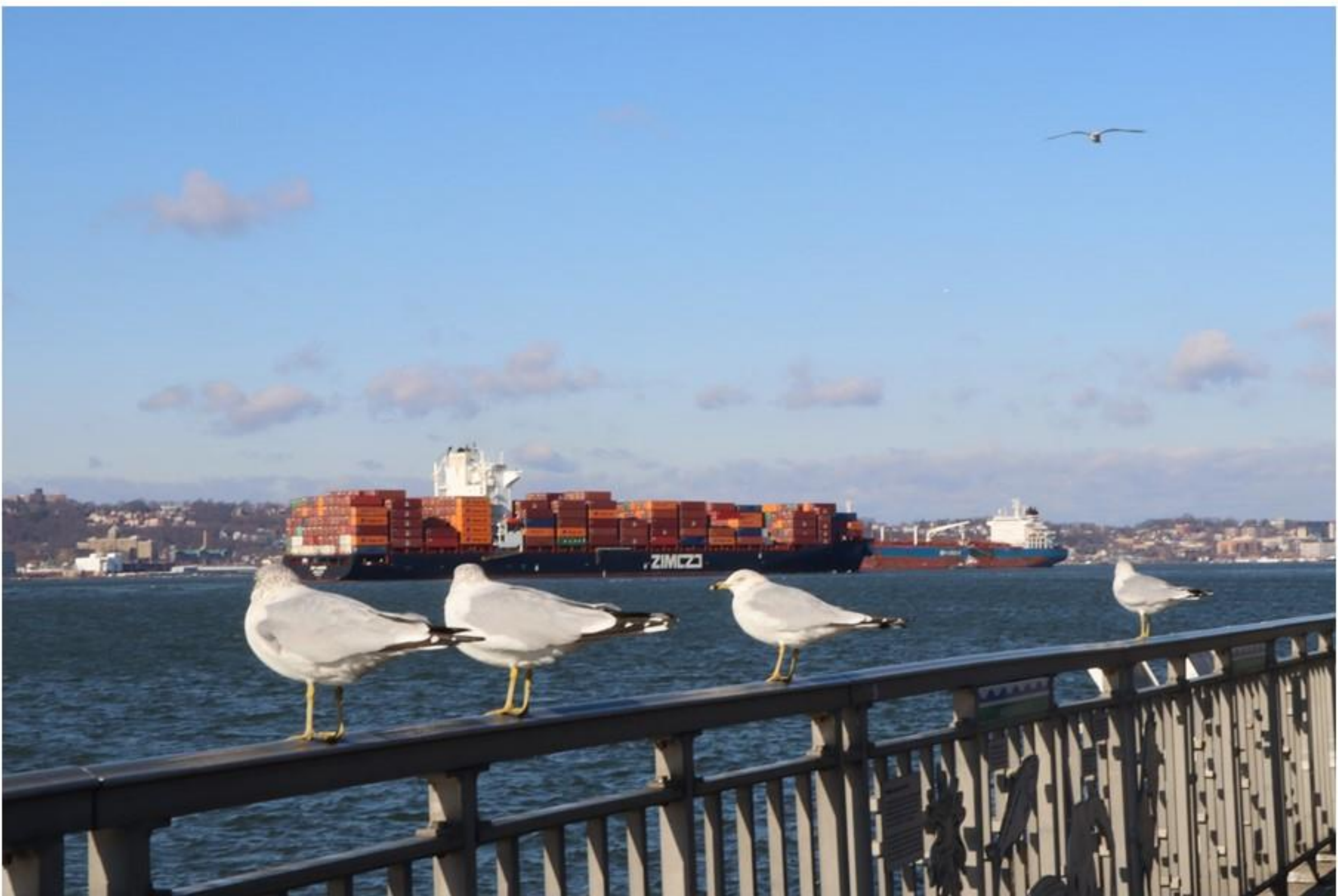
SEBASTIAN ZAK, 9