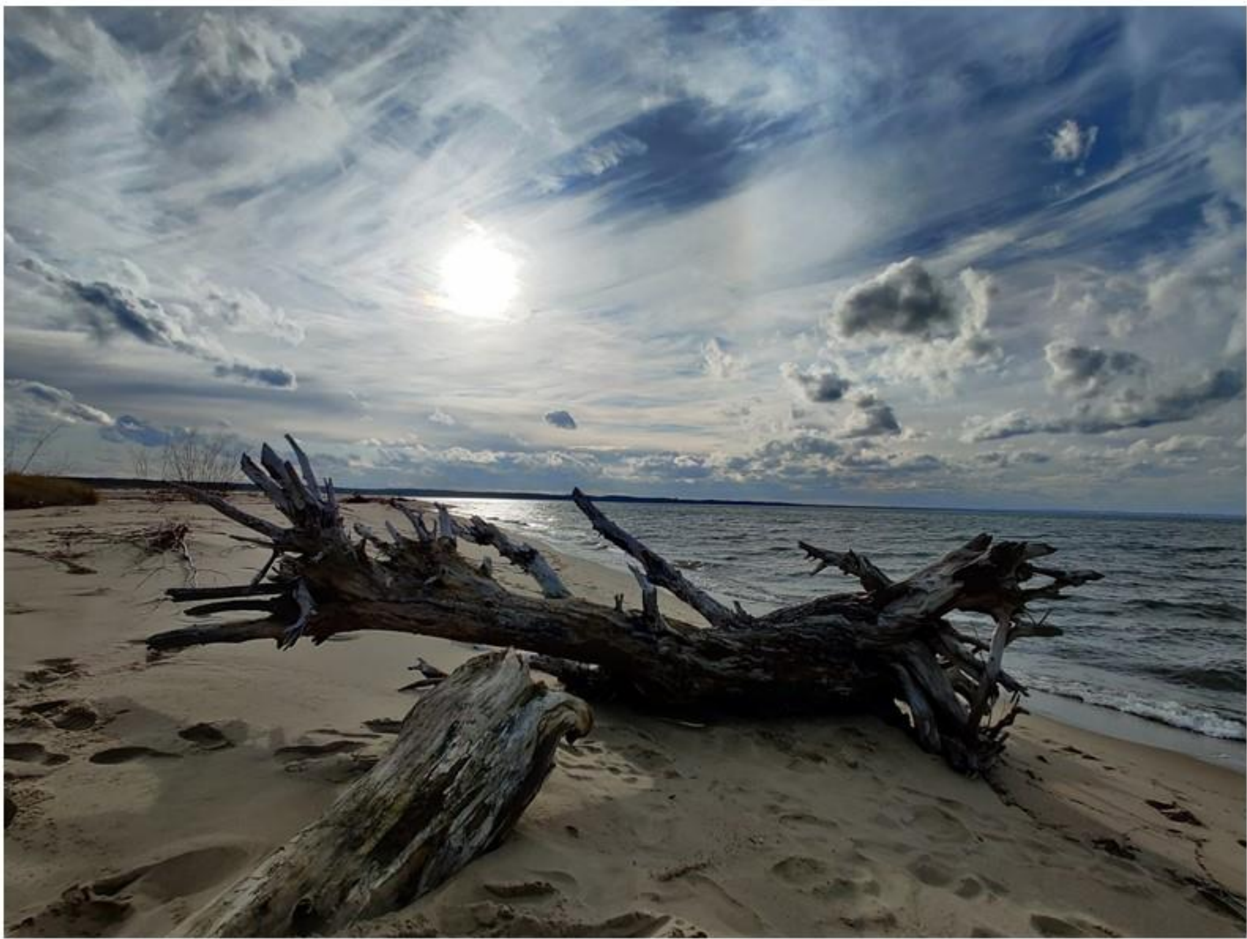
BARTOSZ BABIUCH, 13