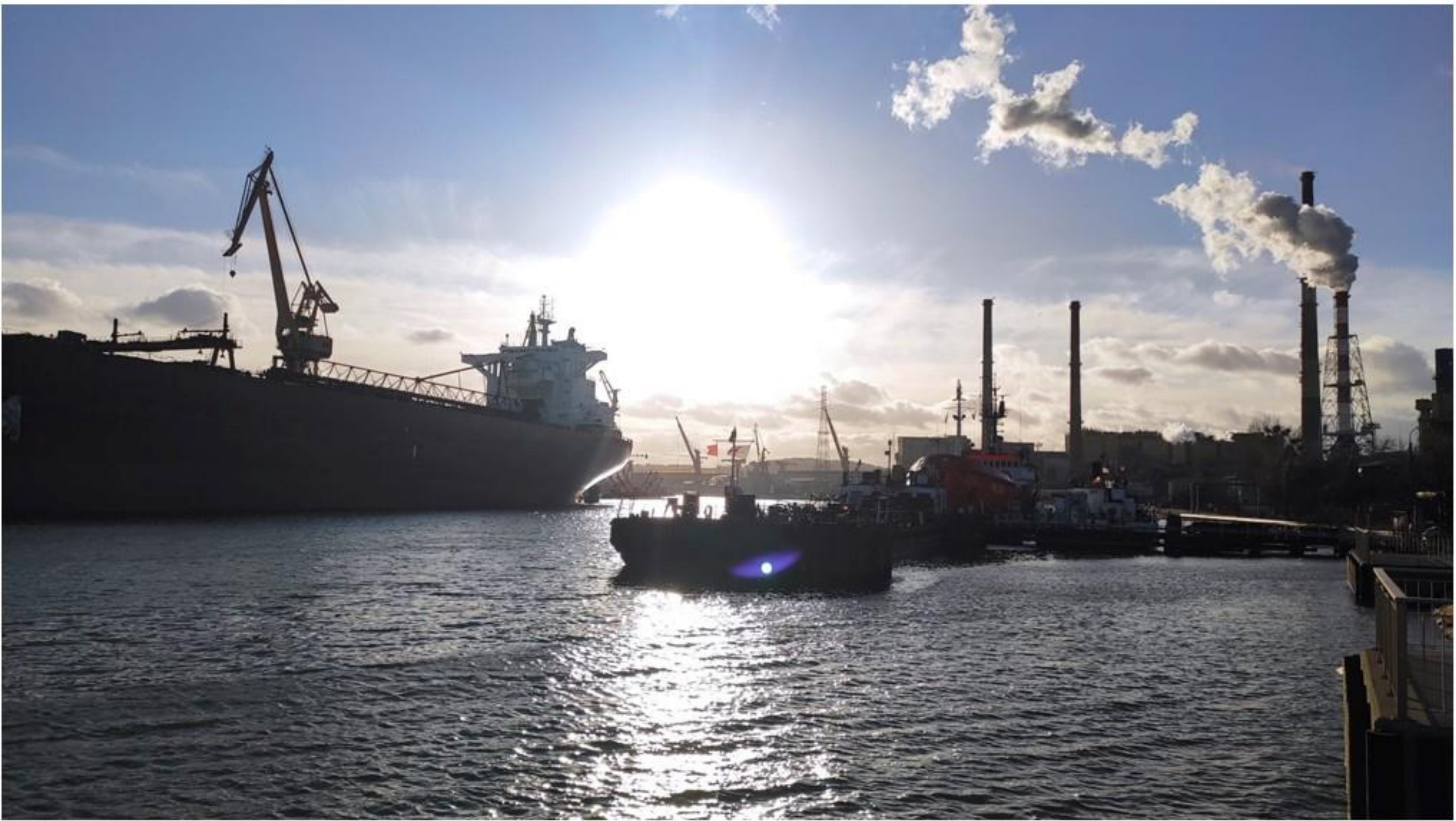
MAJA PAŁUBICKA, 14