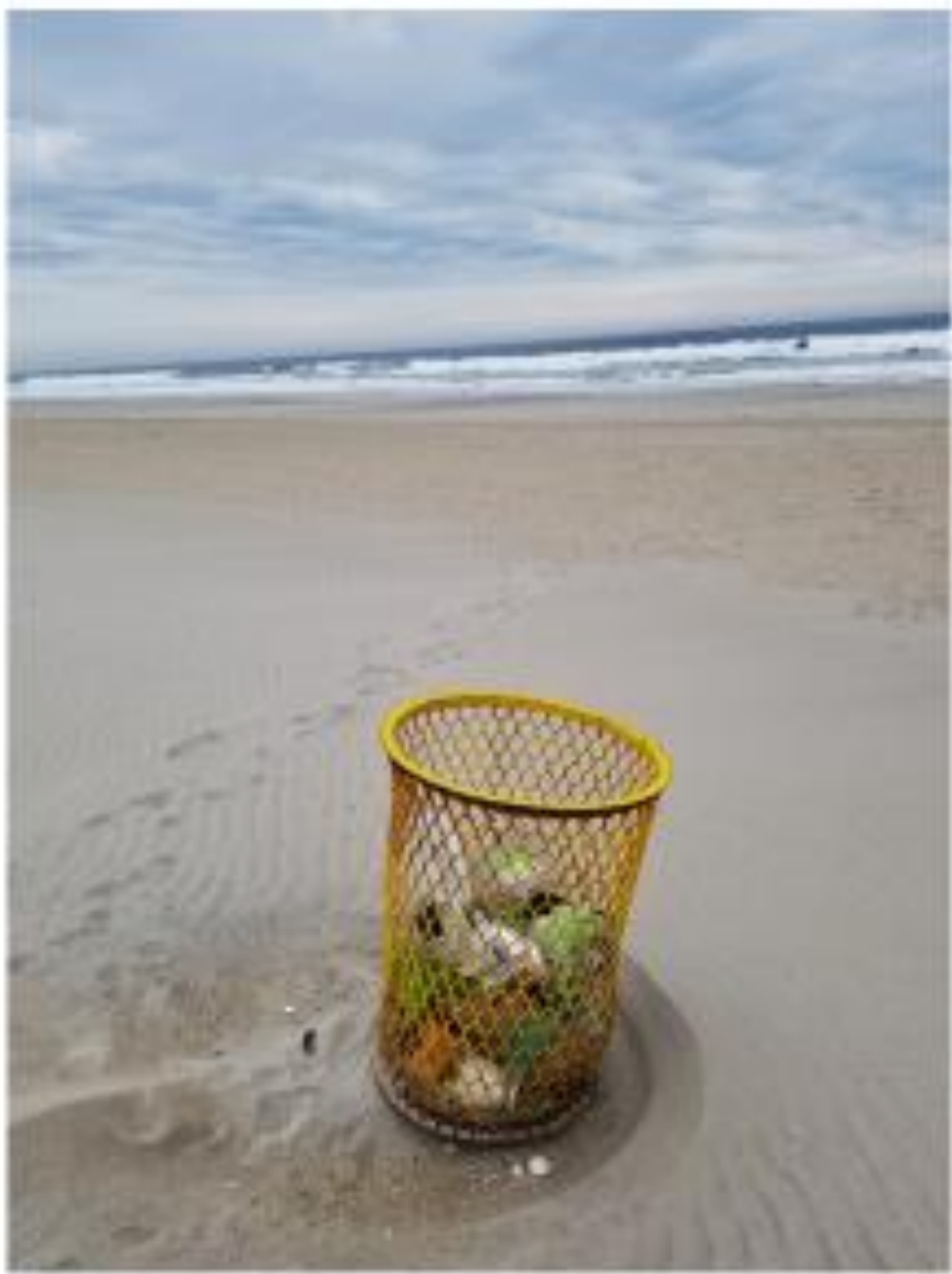
KACPER WROBLEWSKI, 7 JUST FOOTPRINT, NO TRASH USA

There is no trash, just footprint, it means people cleaned the beach after themselves. My mommy and daddy taught me that it's so important to leave the beach clean, so animals don't get hurt by trash. That's why I leave just my footprint!