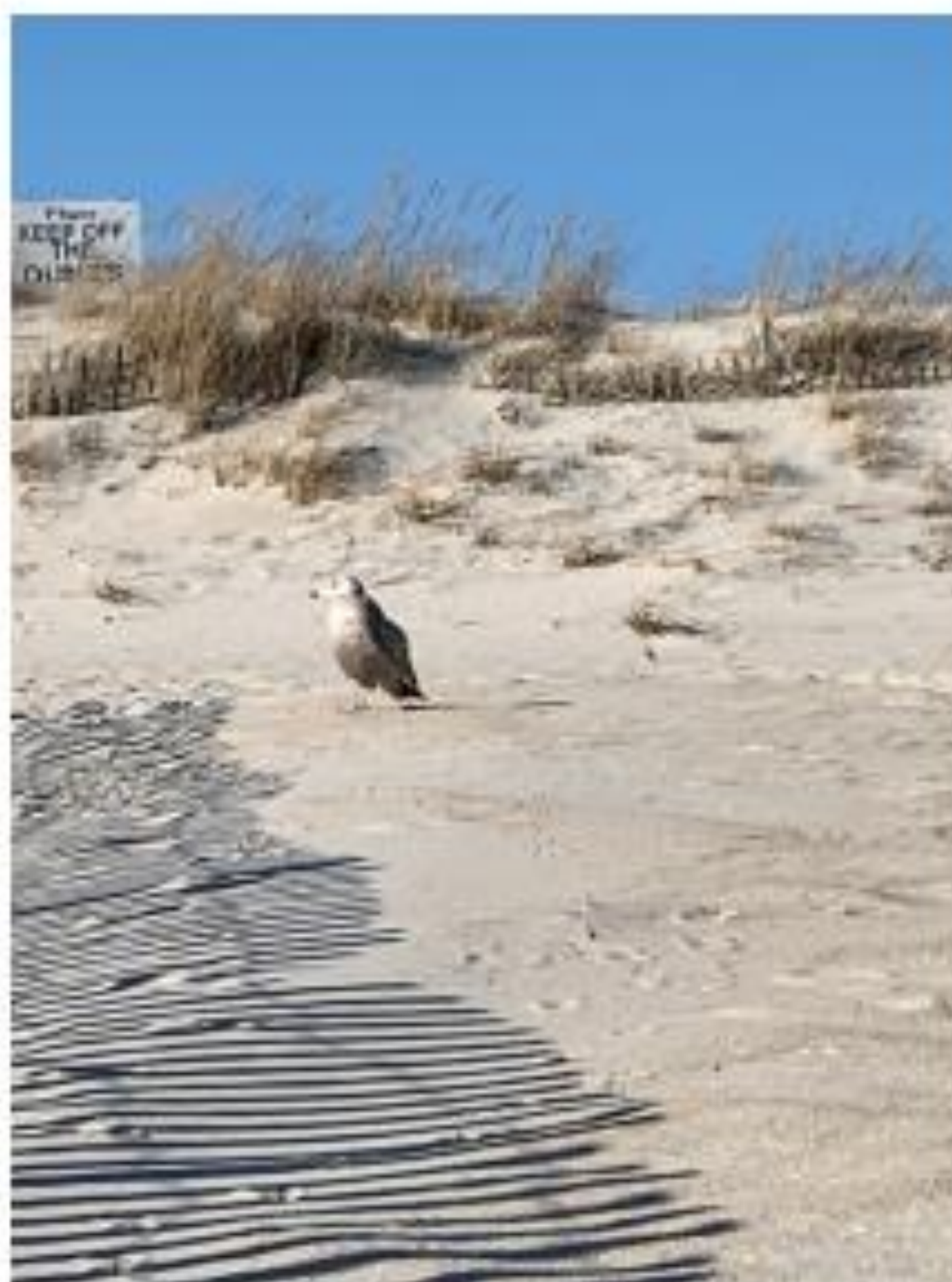
ALAN KOSZELAK, 13, USA

WE ARE ALL RESPONS-IBLE FOR THE OCEAN AND ITS LIVING ITS LIVING CREATURES