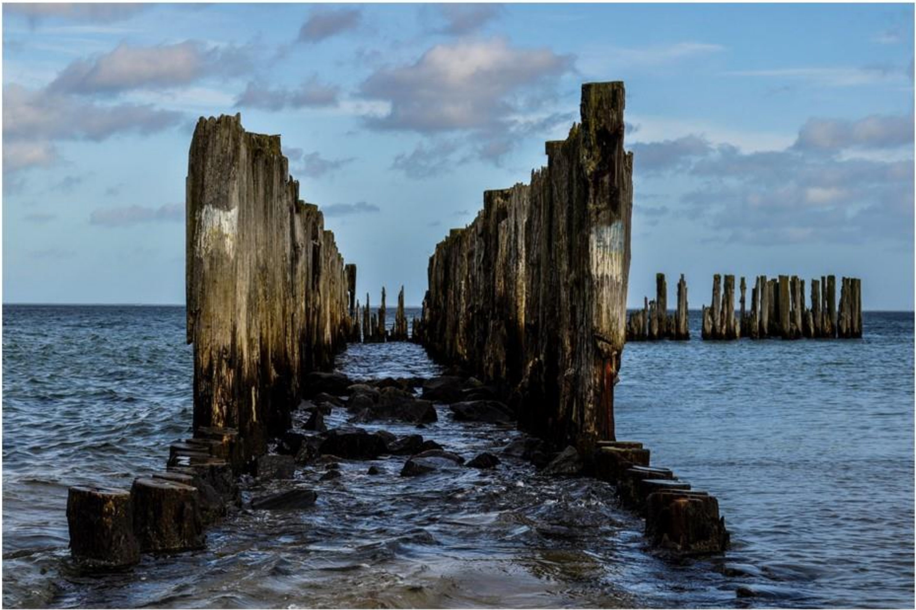
ZUZANNA MENTEL, 12