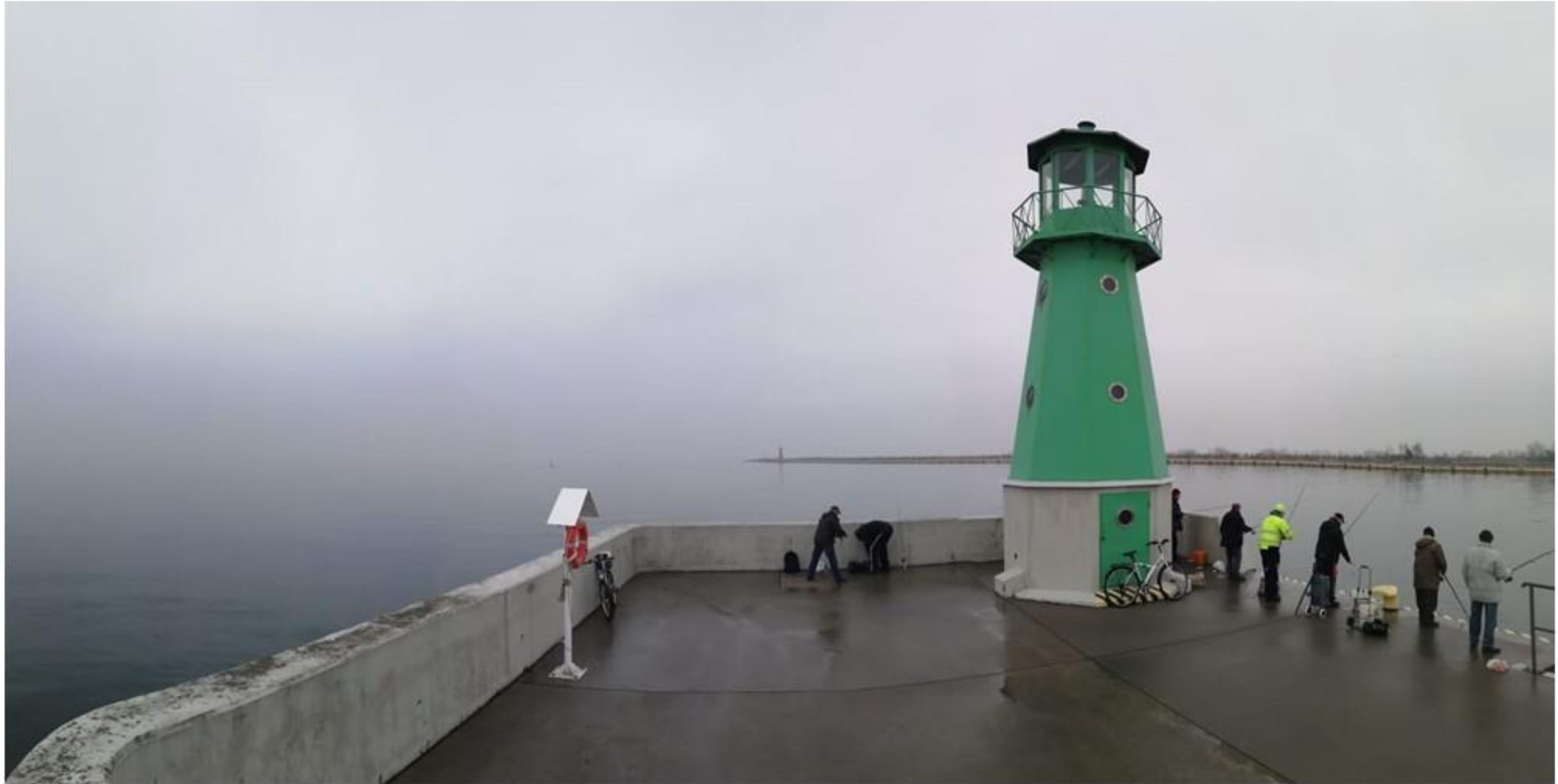
JAKUB KOWALIKOWSKI, 15